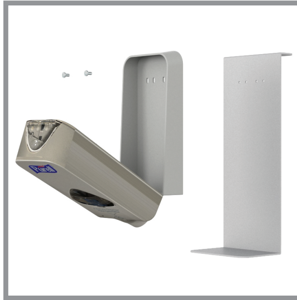
2. Connect dispenser to mounting plate using at least two screws or adhesive