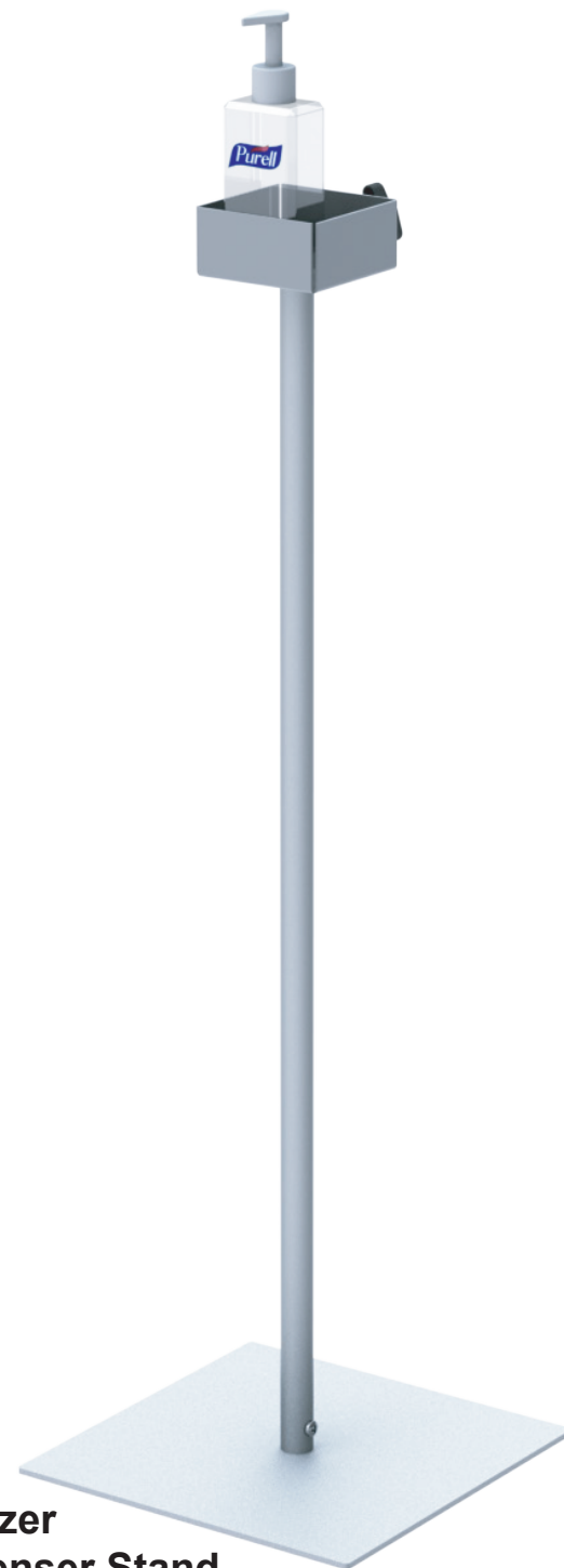
Hand Sanitizer Pump Dispenser Stand HSPDS