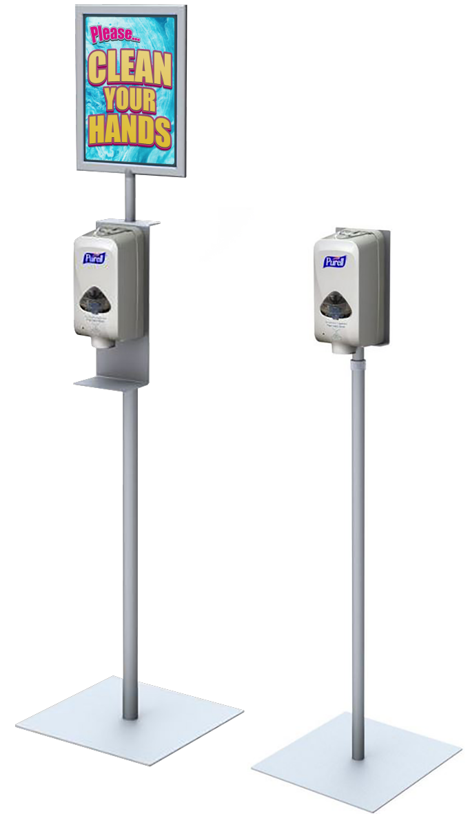
Hand Sanitizer Dispenser Stand HSDS8511