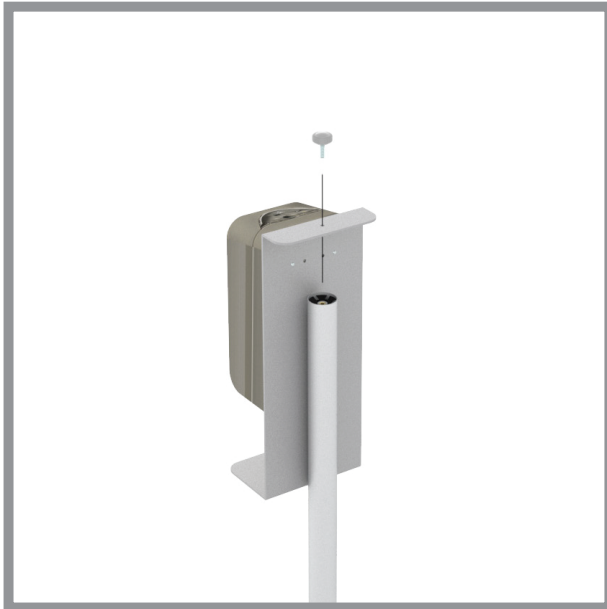
3. Mounting plate can secure to the pole with a single screw