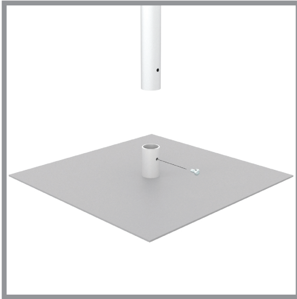
1. Connect pole to base using philips head screwdriver